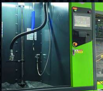
Exclusive, Unique DPF Connection System