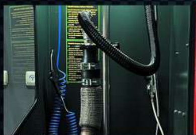
Filter Fixing Device