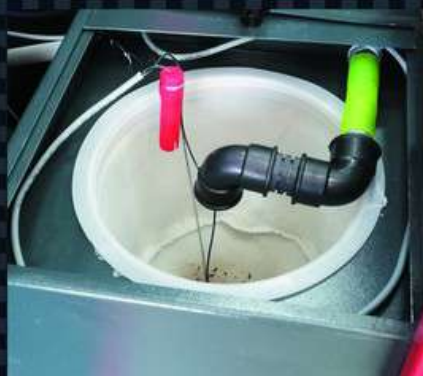
Wastewater Filtering Section