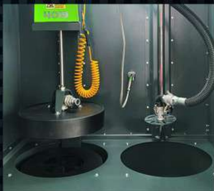
Special Machine For Your Service With Color Options

With PTM4019, Maximum Fuel Saving, Increased Traction Power, Tidy Operation of Turbo is Provided