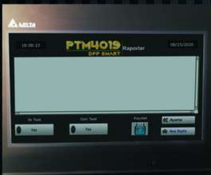
History Cleaning Information With Reports Screen