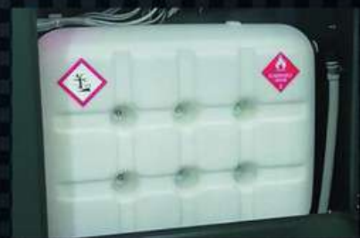
Sediment Water Waiting Tank

With PTM4019, Maximum Fuel Saving, Increase of Traction Power, Healthy Working of Turbo is Ensured