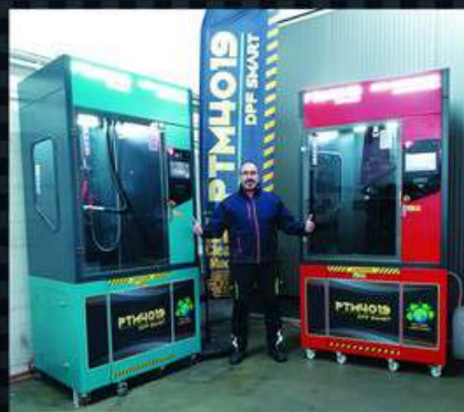
Amazing Results in Just 19 Minutes