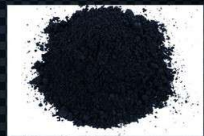
Particles After Cleaning