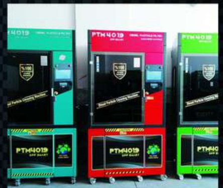
Special Machine For Your Service With Color Options

With PTM4019, Maximum Fuel Saving, Increased Traction Power, Tidy Operation of Turbo is Provided