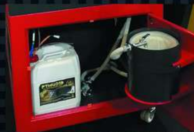
Cleaning Liquid and Sediment Filter