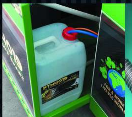
Cleaning Liquid Section