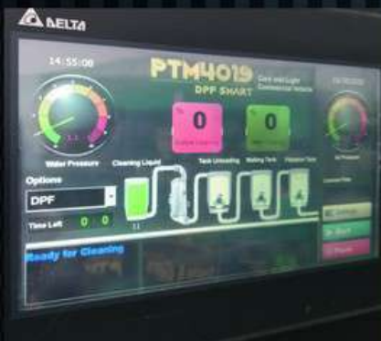
Updated Software and Added New Features