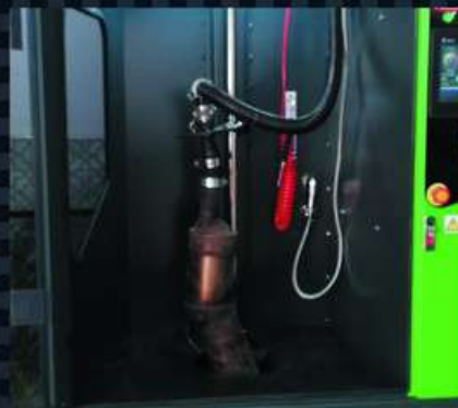
Comfortable Use with 180 Cm Indoor Height