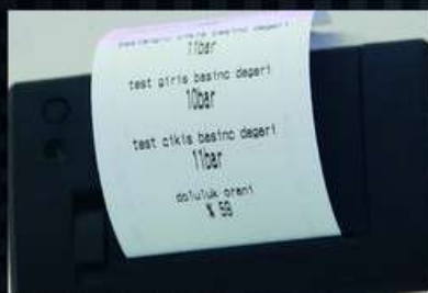
Occupancy Test Measurement and Printout