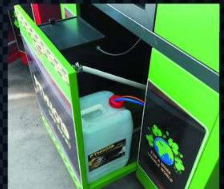
Auto Opening Cleaning Liquid and Waste Filter Section